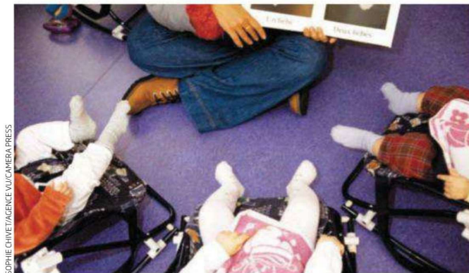
Children's minds are finely tuned to the sounds of language